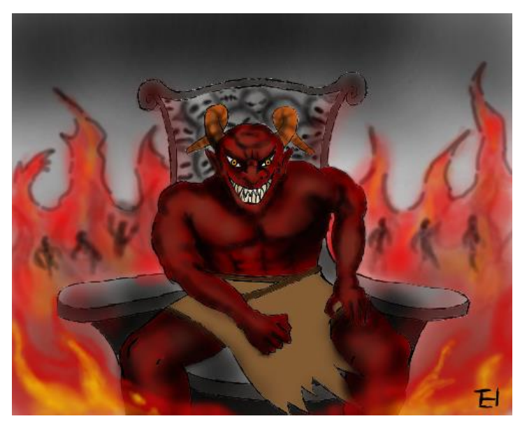
There is a cost for sin!

Yahiya 3:36 Taga-kallum kakkal ni kasaumulan sasuku angandol ma Anak Tuhan. Sasuku mbal angandol maka mbal ameya' ma Anak Tuhan, halam aniya' kallum sigām kakkal sagō' pat'ddas du sigām ma mulka' Tuhan.