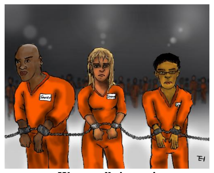
We are all sinners!

RŌM 3:23 sabab makarusa sigām sali'-sali' ati halam aniya' maka'abut ni ka'adilan Tuhan.